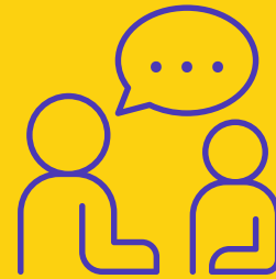
Consultation Process & Collection of Best Practices