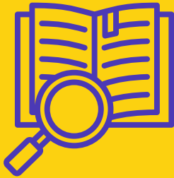
Desk Research & Needs Assessment