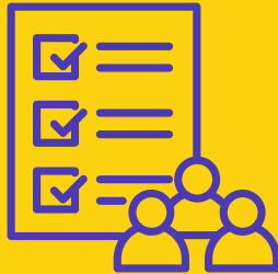
Organisational Assessment Tool (OAT)