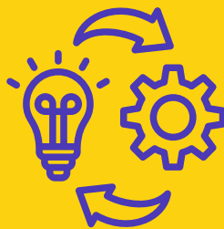
Framework Development, Implementation, & Dissemination of Results*

The Organisational Assessment Tool optimised for general and youth-led drug policy reform/harm reduction organisations was created as part of the open nature of the project and its expected impact on other organisations that can benefit from cooperatively tackling their key areas of improvements. It revolves around the three pillars of the project (1. Leadership Transition, 2. Institutional knowledge/memory, and 3. Long-term strategy). However, by design, it can and should be modified as needed in its specific content as well as reimplemented periodically.